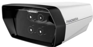
Panomera® Perimeter Designed for AI based perimeter protection