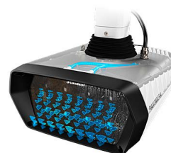
Panomera® Extensions Smart extensions with remoter control over the network

Panomera® is available in various versions for many different use cases.