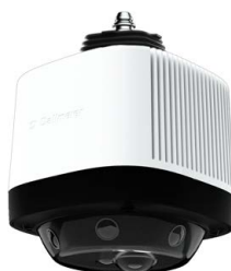
Panomera® W4/8 Area Optimised for the acquisition of a complete half-space