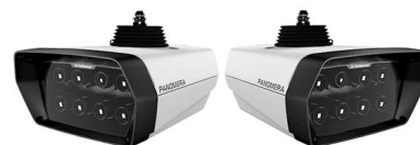
Panomera® S8 Runway The complete runway in a high resolution overview