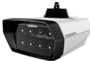
Panomera® S4/8 Area Acquisition of huge areas with consistent depth of field