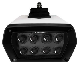
Panomera® S4/8 Stadium Efficient acquisition of very distant areas